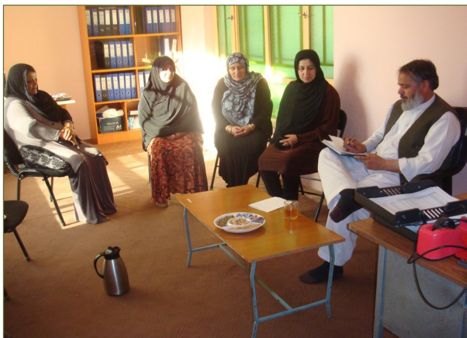
A view of meeting of Rustaq Small Scale Commercial Layer Poultry Project staff and head office delegation at ADA provincial office, Takhar