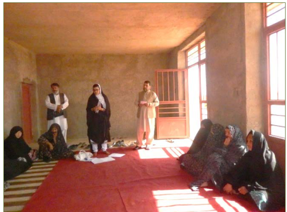
A view of poultry training in Mohammadia village of Guzara district, Herat