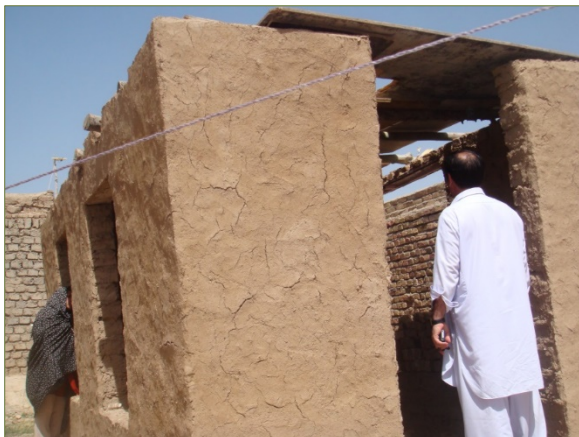
A view of poultry coops construction in Shakoor Khani village of Guzara district, Herat