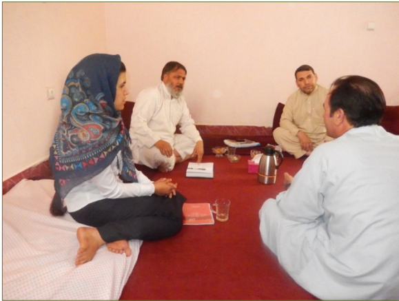
A view of M&E team meeting with project staff at ADA Guzara office, Herat