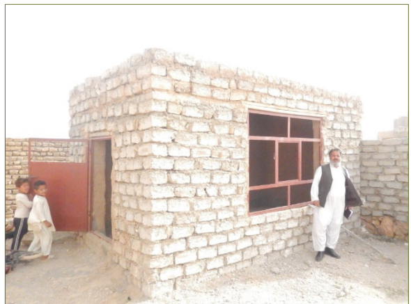
A view of constructed coop in Mohammadia village of Guzara district, Herat