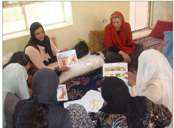
A view of poultry training session in Shakoor Khani village of Guzara district, Herat