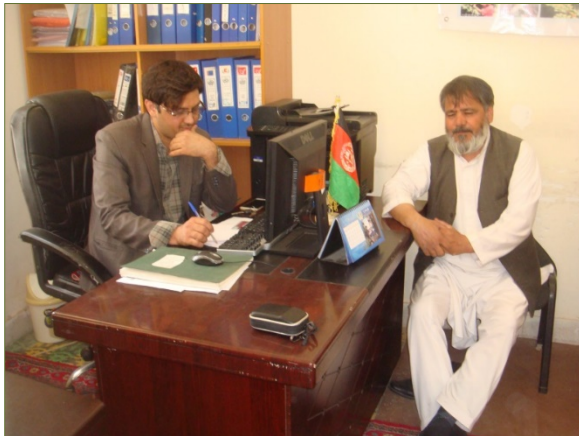
A view of meeting with Guzara district Agriculture/Livestock Department Manager