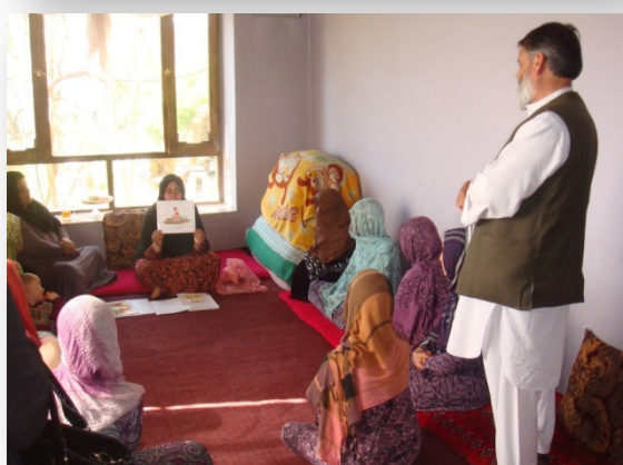
A view of on going training in Aahan Dara village for project beneficiaries, Taluqan, Takhar