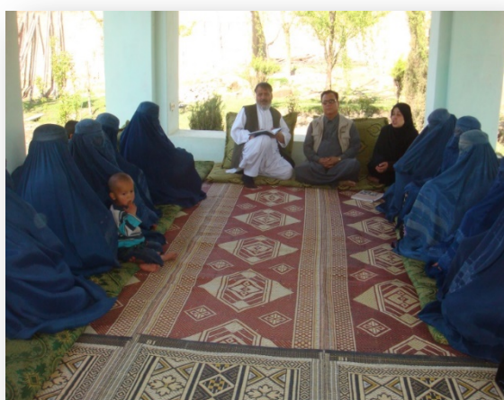
A view of meeting with Besh Bator village beneficiaries on project services, Taluqan, Takhar