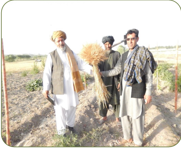
A view of sample of wheat cultivated in Tori demo plot in Tirinkot district of Uruzgan province