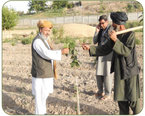
A view of sapling of figs at Tori demo plot, which is being cultivated in Tori village of Tirinkot district