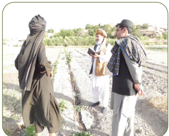
A view of discussion with Talani lead farmer at Talani demo plot of Tirinkot district