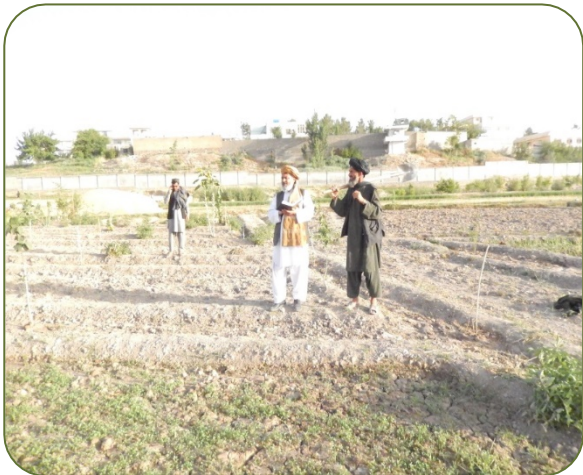
A view of Alfalfa being cultivated in a demo plot in Tori village of Tirinkot district