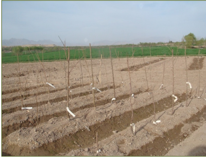
Nursery part in Toori Village demo plat