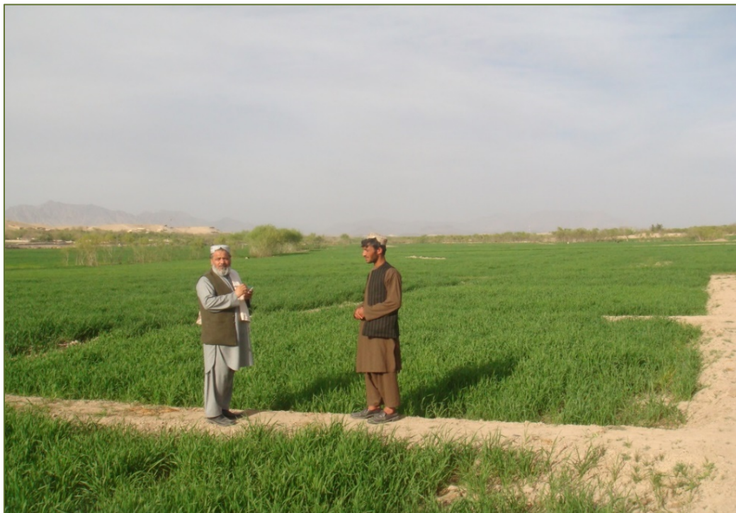
Led farmer of Toori Village is explaining wheat cultivation in the Demo plat