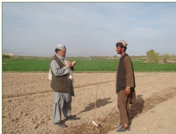
Led farmer of Toori Village is explaining saplings planting in the demo plat