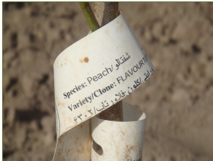
Specification of sapling in the demo-plot