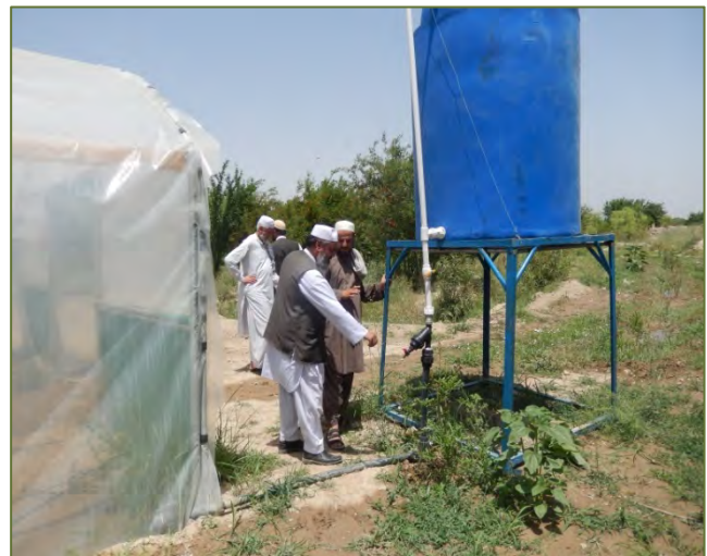
The lead farmer of Langar village expresses his concerns over the water stand reservoir