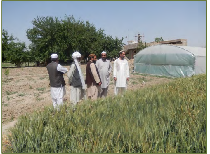
Demo plot of Arazi village