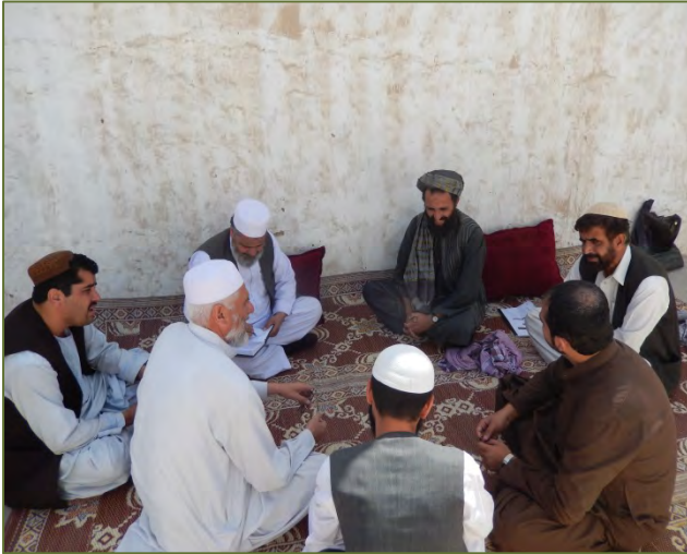
A view of meeting held with lead farmers of Dah Sabzi demo plot in Arghandab RADP-S office in presence of project staff