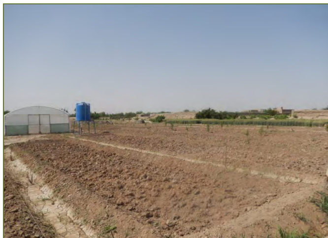
Demonstration Plot of Sher-i-Surkh village of Dand district of Kandahar