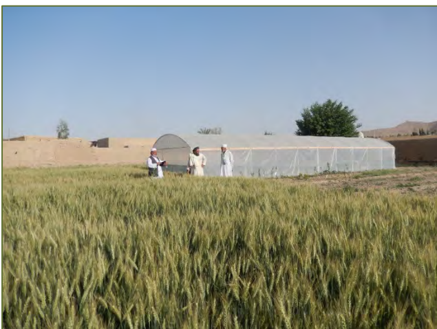
A view of demo plot of Shorandam village of Daman district