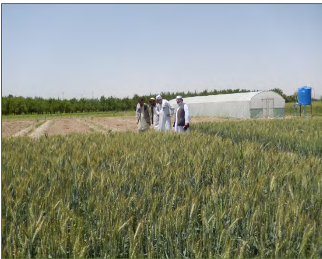
A view of Bagh-i-Sardi wheat growth demo plot, Arghandab district of Kandahar province