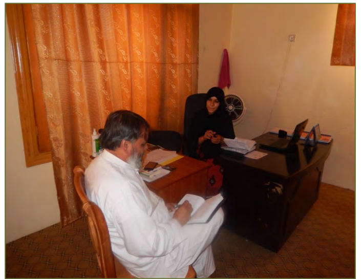
Meeting with Gender Specialist of Kandahar RADP-S office about the activities carried out during the last few months