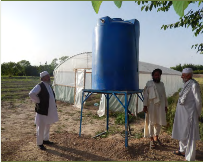
5000L water reservoir with its stand provided for each demo plot owner by Chemonics