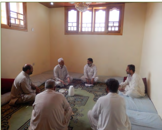
Meeting with RADP-S Kandahar director and managerial staff