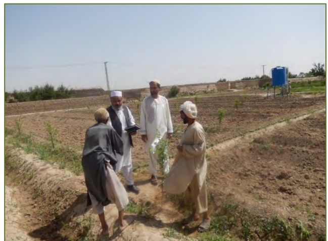
She-i-Surkh village demo plot owner with his father expressing their happiness about project activities