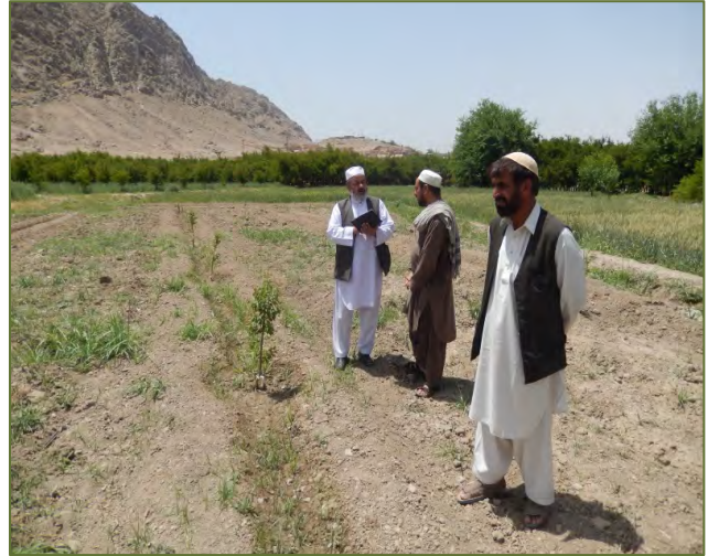
Lead farmer of Langar village is being interviewed about his responsibilities in the demo plot