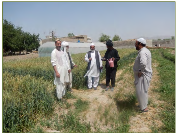
The owner of Arazi village demo plot explains the benefit of training provided for demo plot establishment