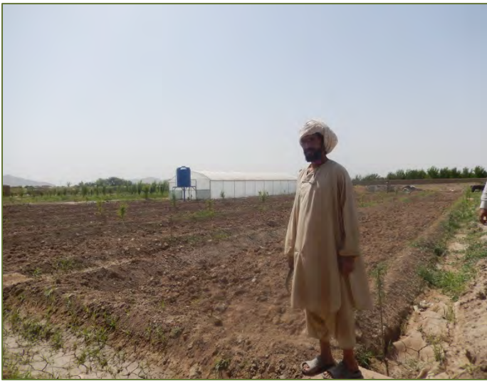
A view of She-i-Surkh village demo plot