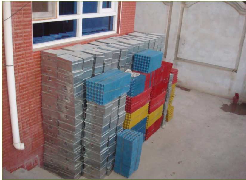
The final package for poultry project beneficiaries were stored in ADA Kunduz office and were ready for distribution