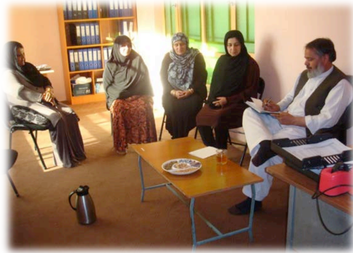
A view of meeting of head office delegation with Improved Backyard Poultry Project staff of Bangi and Baharak districts of Takhar province