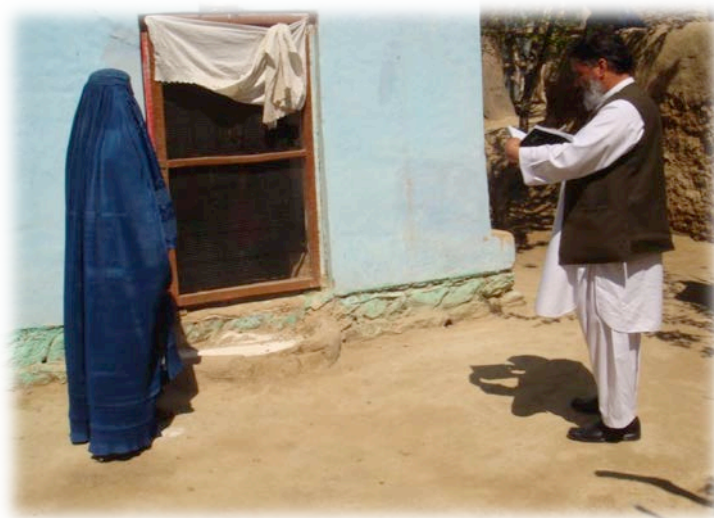
One of the beneficiaries in Qul Burag village of Bangi district expresses the benefits of project