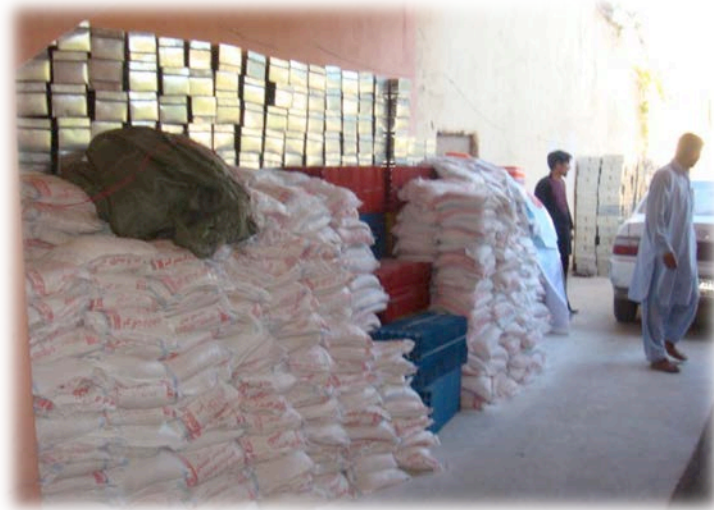
Equipment and material provided by NHP and will be distributed to the VGLs and beneficiaries