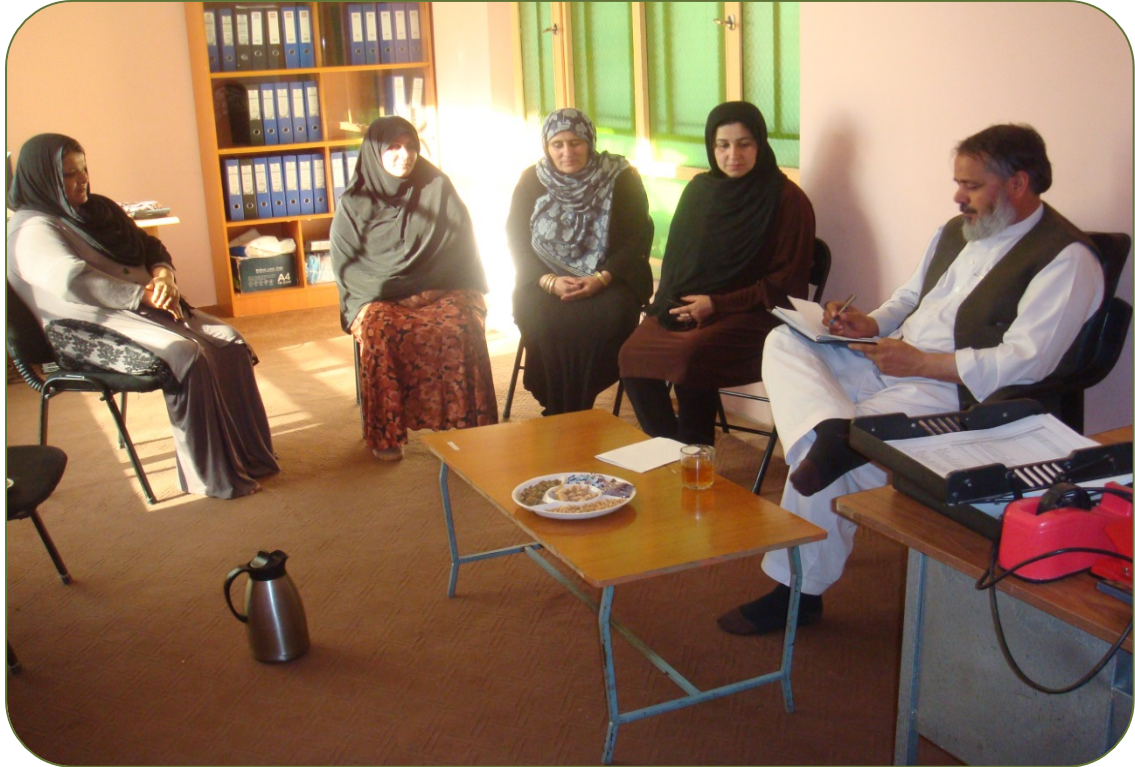
A view of meeting with Improved Backyard Poultry Project staff in provincial office, Takhar