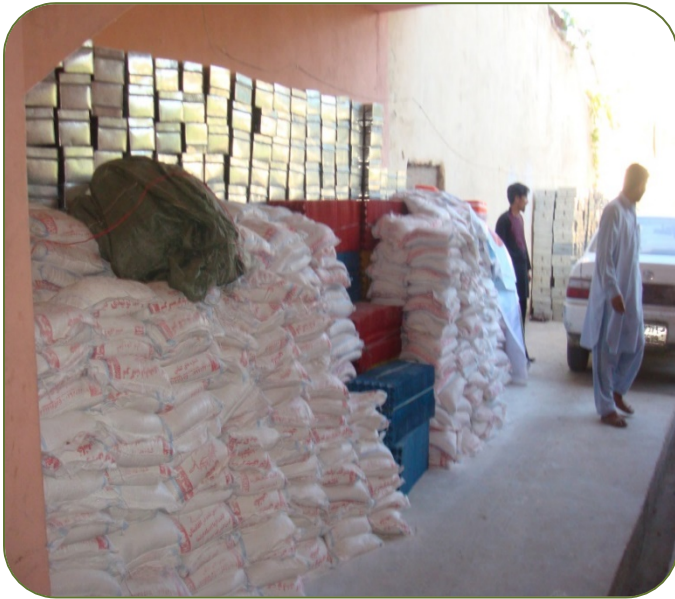
NHLP/MAIL provided equipment and materials stored in ADA provincial office for distribution to beneficiaries