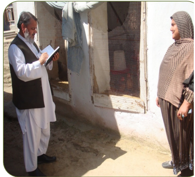
VGI in Aaq Masjed village of Baharak district explains the benefit of project