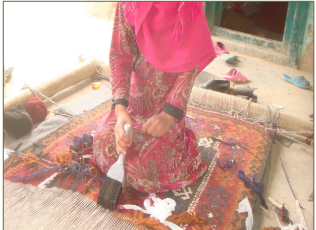
A view of practical work of Gilam weaving skill training in Faryab