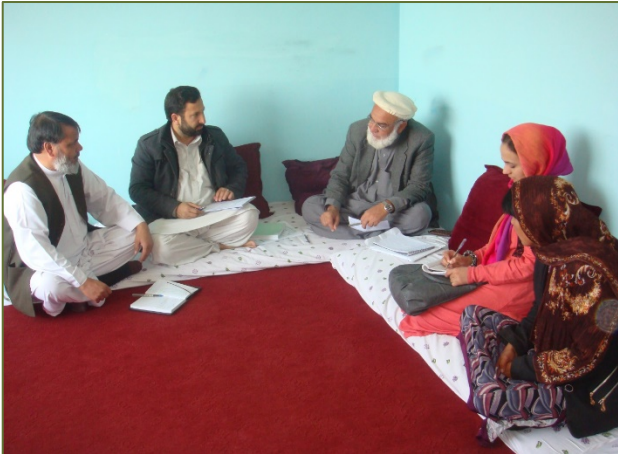
A view of meeting with project staff and head office monitoring delegation, Maimana, Faryab

1 For minimizing the security risks, it is recommended to change the TEMP vehicle to a rental one until the security situation gets better in Faryab province.