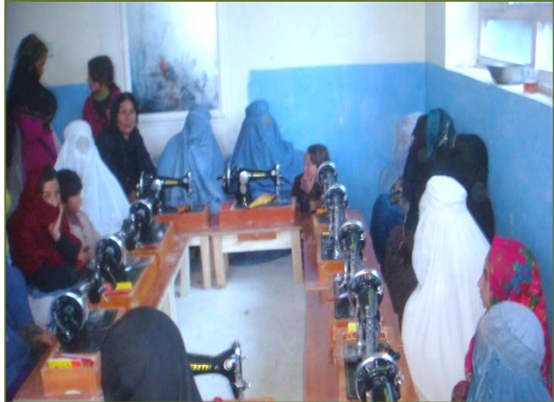
Project beneficiaries received tailoring machines and other kits, Chak Aab Qasim CBO, Faryab