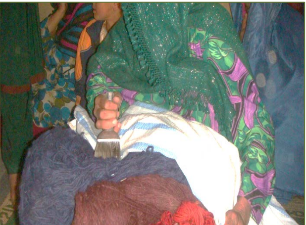
A beneficiary of Gilam weaving skill training secures Gilam weaving working kits, Faryab