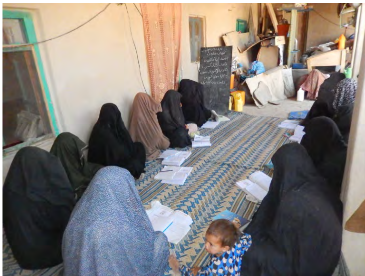
A view of literacy class (Class No. 3) in Charamger Village, which shows 90% of students' availability