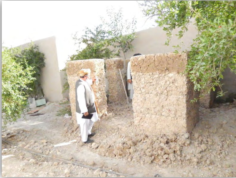
A view of coop construction activity was in progress in Charamger village, Tirinkot