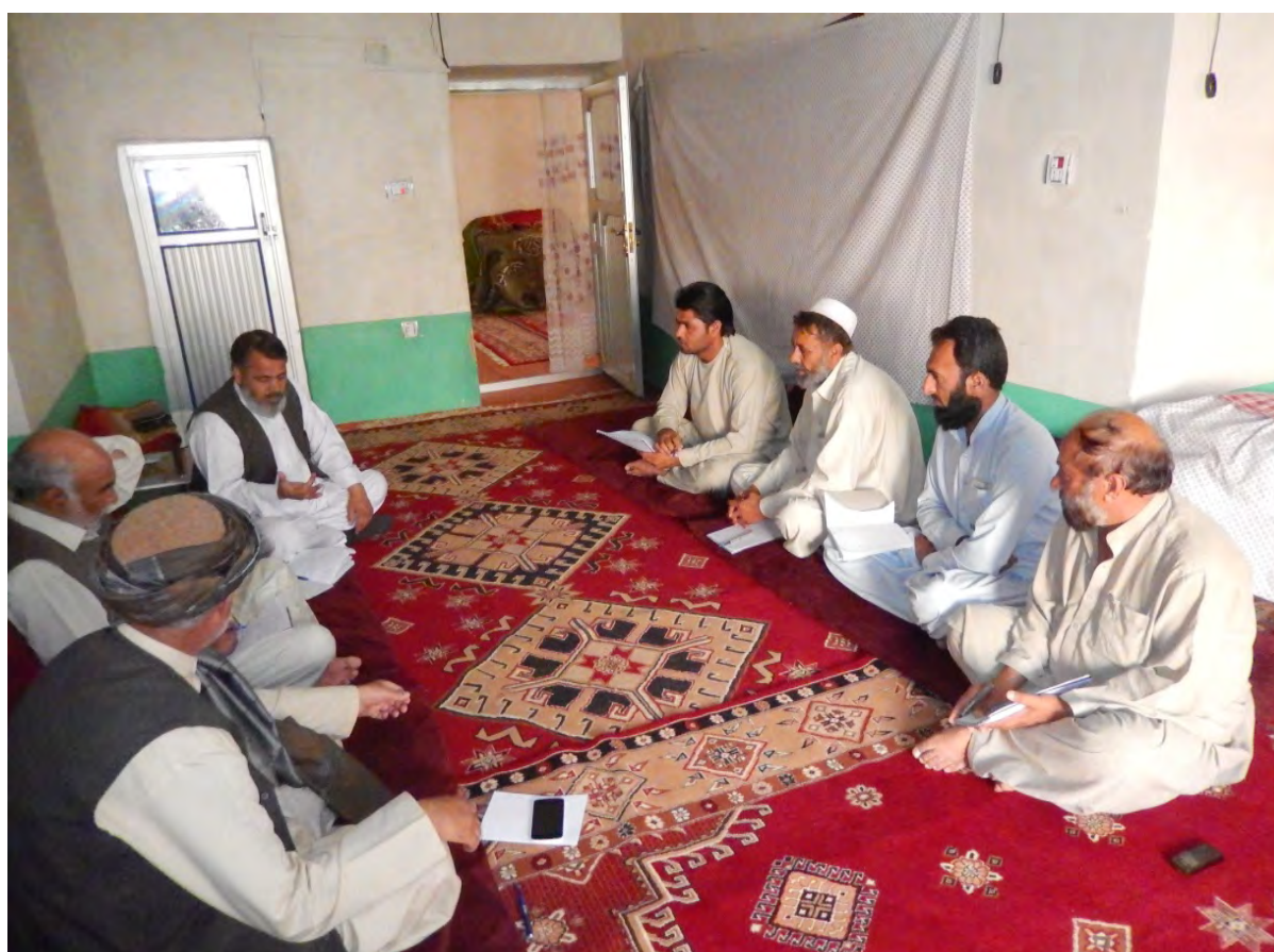
A view of meeting with provincial staff, Tirinkot, Uruzgan