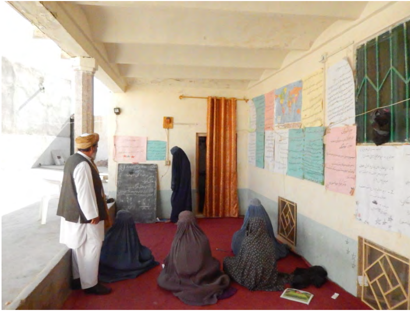
A view of literacy class (Class No. 1) in Ghulaman Kalacha, which shows 60% students are unavailable