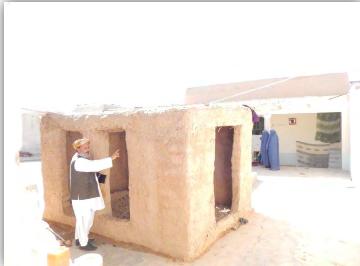
A view of coop construction activity was completed 90% in Ghulam Kalacha