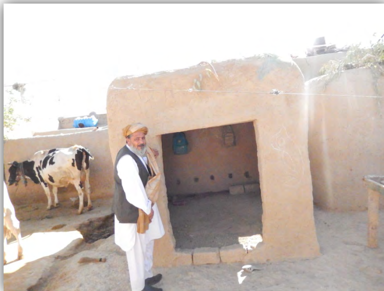
A view of coop construction activity was completed 90 %