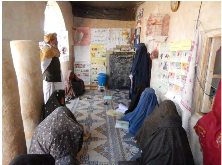
A view of literacy + women empowerment class (Class No. 2) in Ghulam Kalacha, which indicates 85% of students' presence